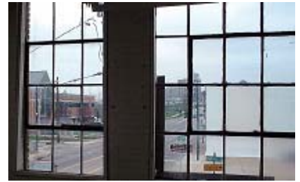
Great Views of Downtown Dayton