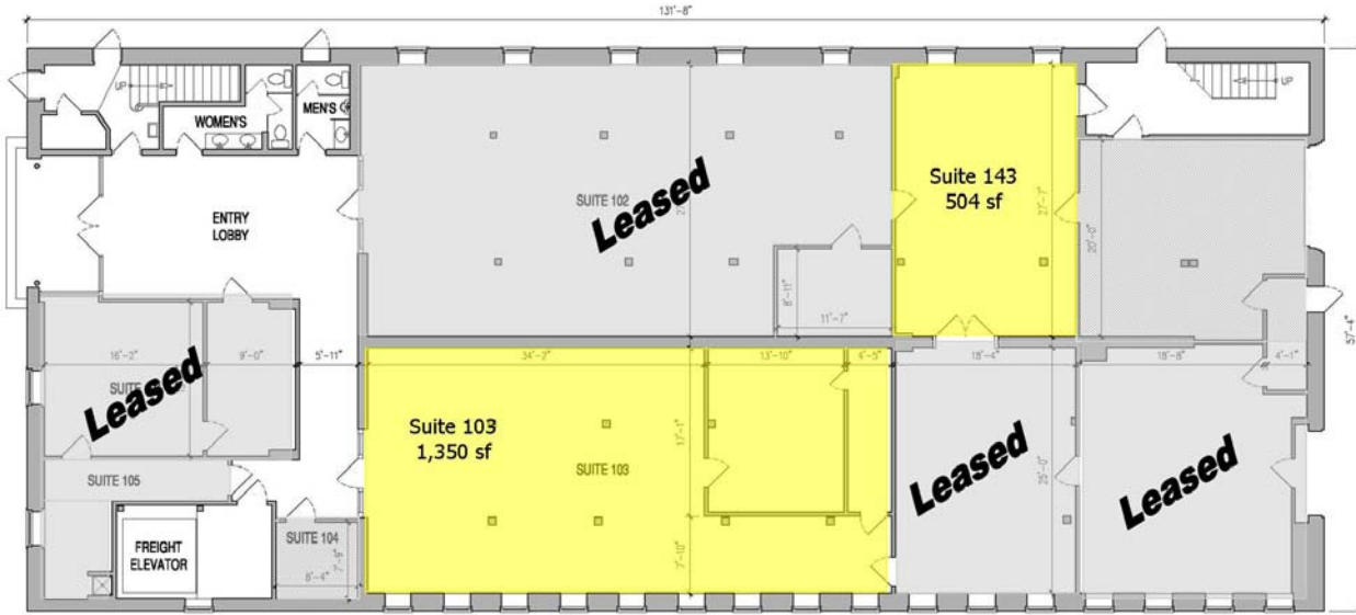
For Demonstration Purposes Only - Drawing Not to Scale