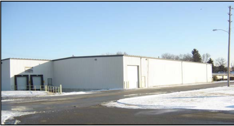
Rear of building