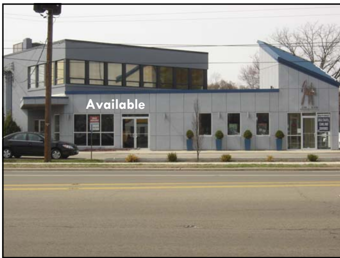
Signage opportunity on Far Hills Ave

Office/Retail Space Available Near the Intersection of Far Hills Ave. and Stroop Rd.