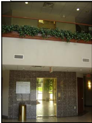
Elegant lobby with elevator access to the second floor.