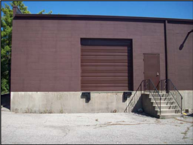
Dock door availability