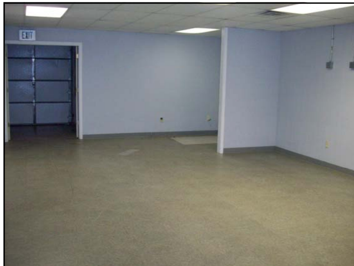
1,800sf Warehouse Space