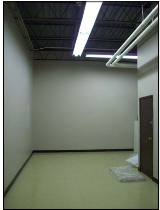
3,000sf Office Space Available with Storage