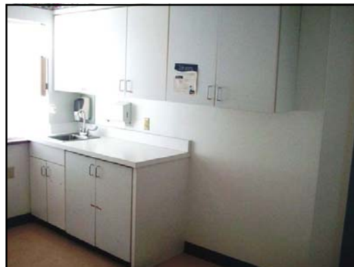
Several Exam Rooms