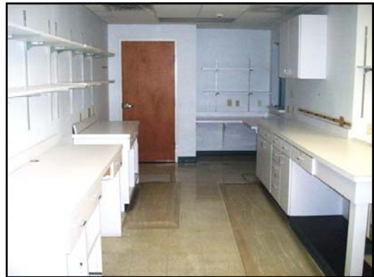
Lab Testing Area

Proximity to I-75, I-675, Centerville and Kettering