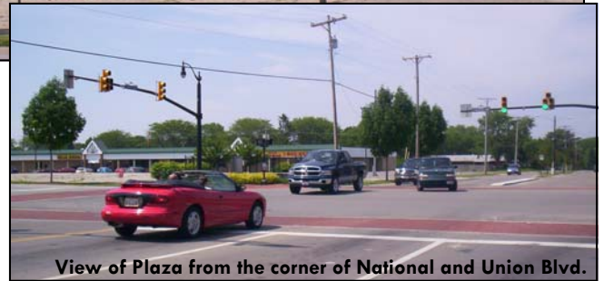
View of Plaza from the corner of National and Union Blvd.